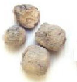
Plate 1: Balls of 'Nzu'

The hair samples of each group was first washed with deionised double distilled water to remove dust particles and then with acetone to remove organic impurities from the hair. Each sample was then taken into a 250 cm 3 pyrex beaker and oven-dried at 60 °C for 6- 8h.