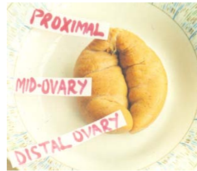
Figure 1: Preserved sample of paired ovary of C. gariepinus indicating proximal-, mid-, and distal sections of the ovary

(n) in the 2.4 ml sample (v). Since the total volume ( V = 250 ml) was known, the total number of eggs per fish (N) or its total fecundity (Fec.) was calculated using the formula: Total fecundity = total volume of eggs per fish ( V ) \times mean egg number in sub sample (n) / volume of eggs in the sample (v).