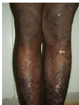
Fig. 2: Lichenified onchodermatitis in a young male.

Data generated were subjected to simple percentages to determine the prevalence of infection among the villages, age groups, sexes and to assess the perception of the disease among the community members. The distribution of onchocercal skin diseases (OSD) among the various age groups were also assessed using percentages.