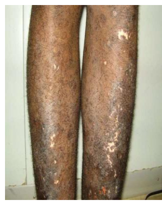
Fig. 4: Leopard skin in a young male.