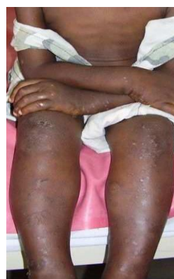
Fig. 3: Maculo-papular rashes (MPR) in a young boy.