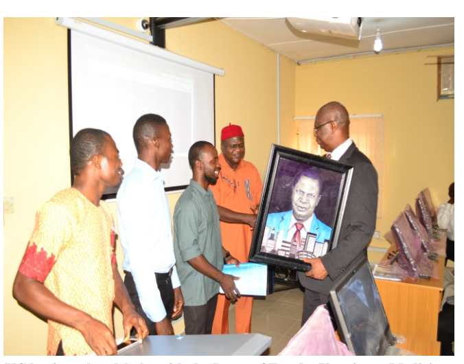
VC having a handshake with the Dean, of Faculty Veterinary Medicine after receiving a gift of his penciled portrait from the faculty