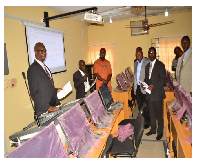
The University PRO served as compere in the commissioning exercise of Smart Classroom in Faculty of Vet Med.