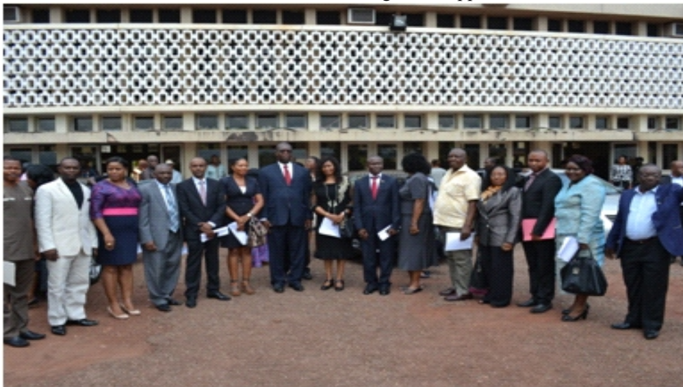
The Vice-Chancellor (7 th from left), some Principal Officers of the University, and members of the LOC of COVIDSET, after VC's Press conference at UNEC.

The Vice-Chancellor outlined sub-themes of the conference to include: State of Science, Engineering, Technology and Innovation (SETI) Education in African, challenges and opportunities Post 2015;