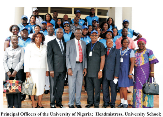
Chairman, Board of Governors of the school and members of University School Old Friends after their courtesy call on the Vice-Chancellor to signal their 2016 homecoming.