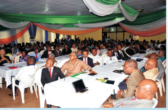
Cross section of participants at the leadership retreat organised for key functionaries of the University of Nigeria on August 9, 2016 at Niger Hall, CEC