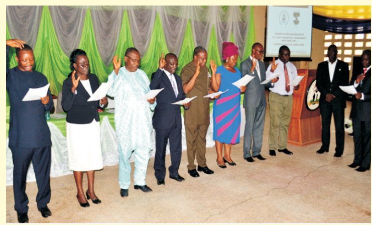
Members of ACTU-UNN at their inauguration

University uphold its culture of excellence through hardwork.