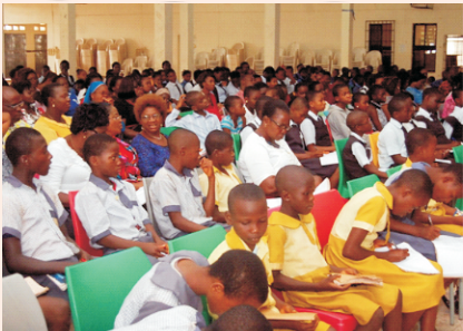
Cross section of participants at the workshop

The University Women Association (UWA) has cautioned children, parents and guardians to beware of the increasing activities of paedophile in their environment.