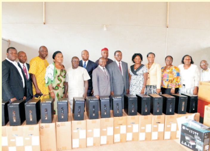
Alumni of the Faculty of Pharmaceutical Sciences, resident in the USA and Canada, posing with 20 set of computers with accessories, they donated to the Faculty of Pharmaceutical Sciences, UNN, 3 rd homecoming of the faculty