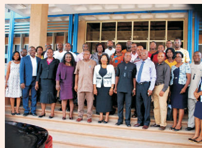
Participants at the training

Lecturers and students of Climate Change Economic Policy and Innovation (CCEPI) were recently trained on how to access E-Resources for their research works. The training, organised by Africa Climate Change Adaption Initiative at the University of Nigeria, Nsukka, (ACCAI-UNN), in collaboration with Nnamdi Azikiwe Library, was held at the digital section of the Library, from Monday 27 th to Tuesday 28 th June, 2016.