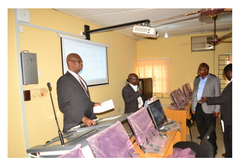
The University PRO served as compere in the commissioning exercise