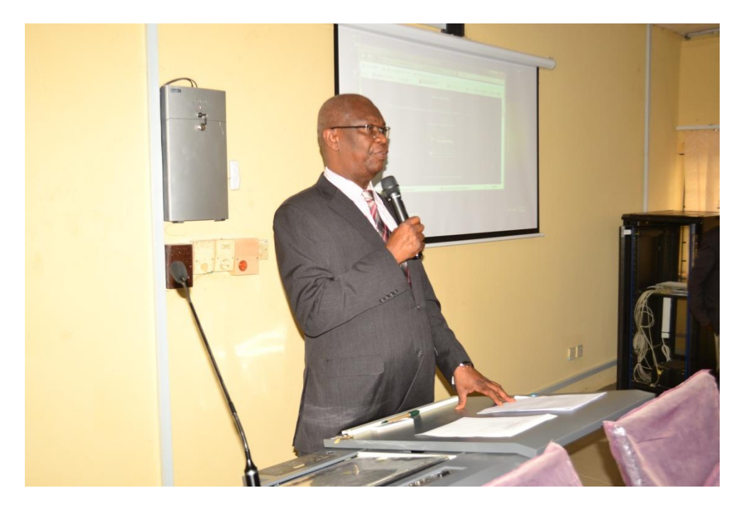
VC addressing staff inside the Smart - Classroom