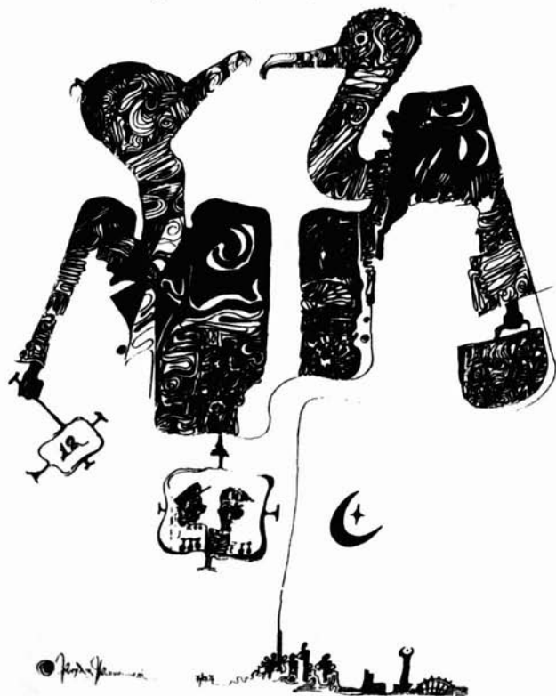
Title: The "Convultural" Conference Medium: Ink Artist: C. Krydz Ikwuemesi Year: 1994