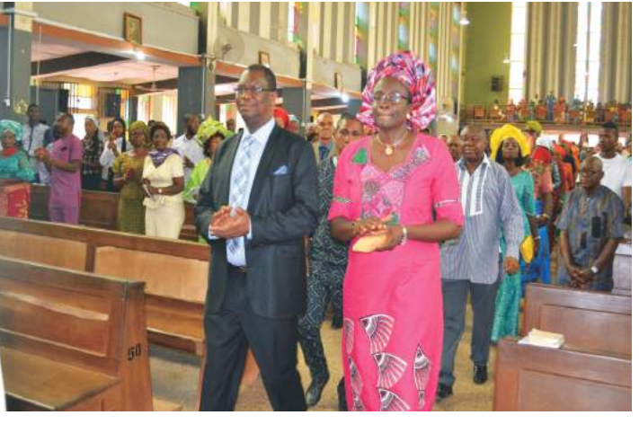
The Vice-Chancellor and his wife leading 46<sup>th</sup> Convocation thanksgiving service at St. Peter's Chaplaincy, UNN