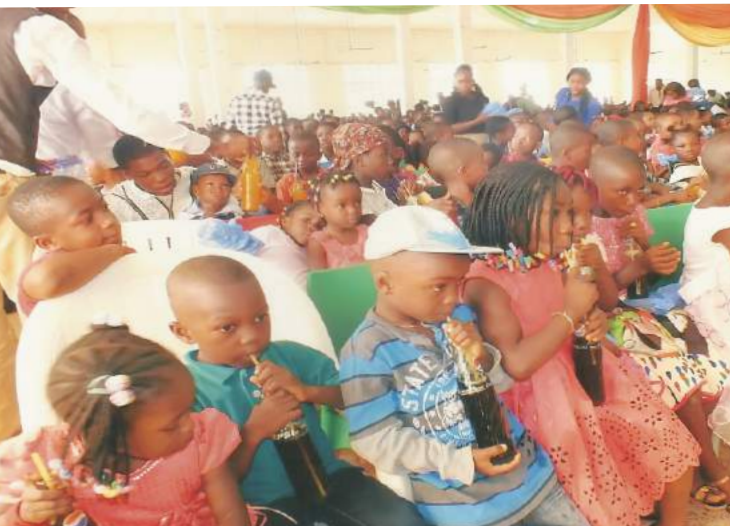
Children at the party