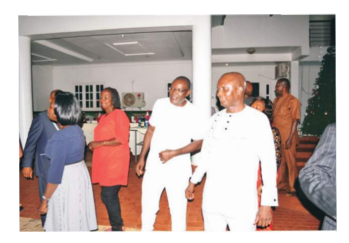
Staff of the University dancing at the 2016 Vice-Chancellor's Christmas party.