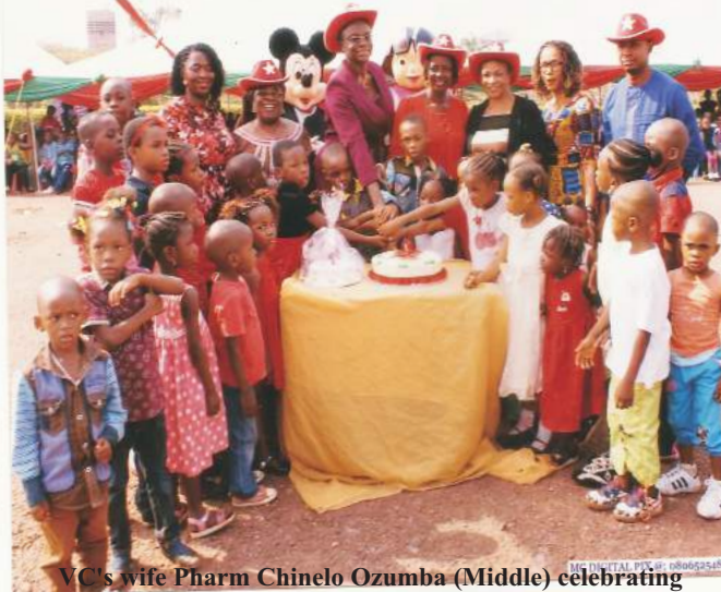
Christmas with staff children