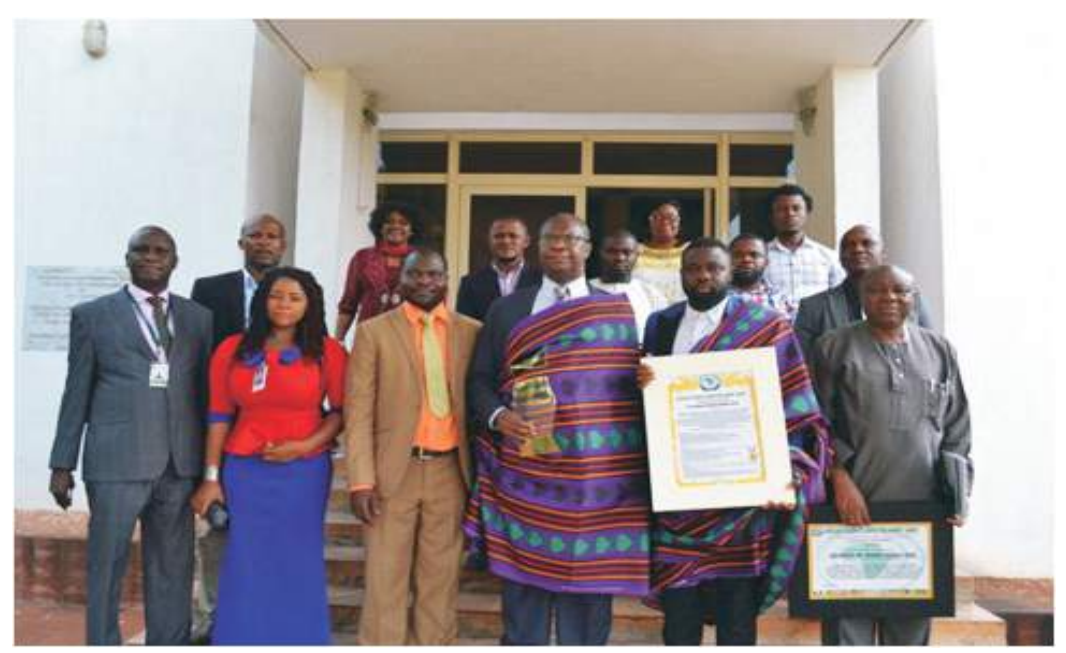
The Vice-Chancellor, Principal Officers of the University of Nigeria and members of African Students Union Parliament (ASUP) after conferring "Pan-African Distinguished Price for Excellence Award" on the Vice-Chancellor, at the University of Nigeria.