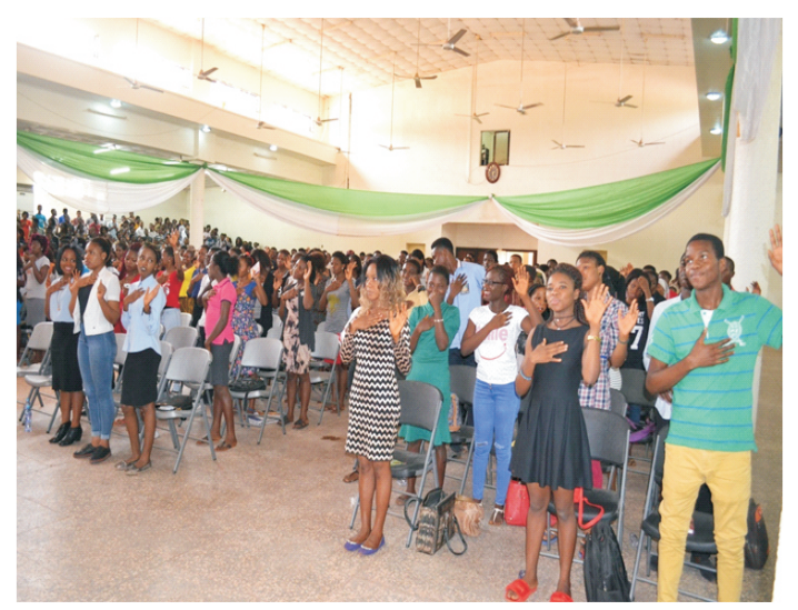
The Students of Joint University Preliminary Examination Board (JUPEB), taking an oath during the JUPEB Orientation.

He urged the students to always use the drop-box to upload materials online such as pictures, as he admonished them to minimize the use of social media for frivolous activities that would be detrimental to their studies.