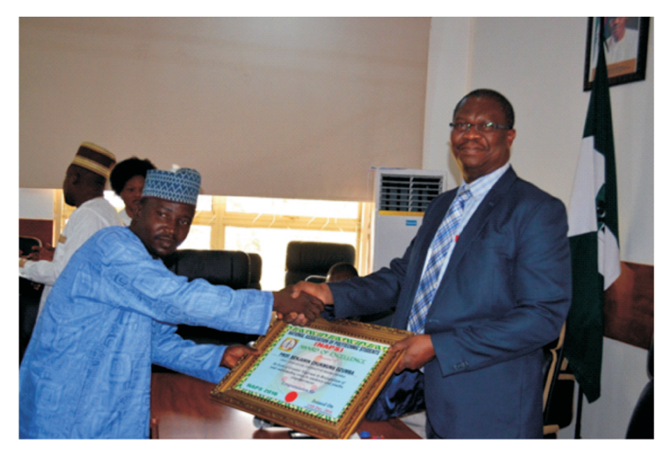
National Youth Council of Nigeria presenting Certificate of Excellence to the Vice-Chancellor in his conference room

University on Monday, 23<sup>rd</sup> January 2017 when he flagged-off activities for