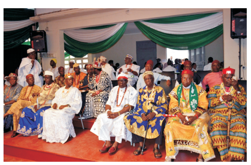
Cross section of traditional rulers at the 46<sup>th</sup> Convocation of the UNN

combination of harsh economic circumstance, poor living conditions, poor environment and a heavy burden of disease.According to Prof. Nwoke these diseases are